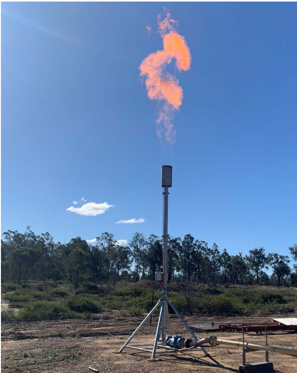
Gas flare at Venus 1 Pilot well during pressure drawdown