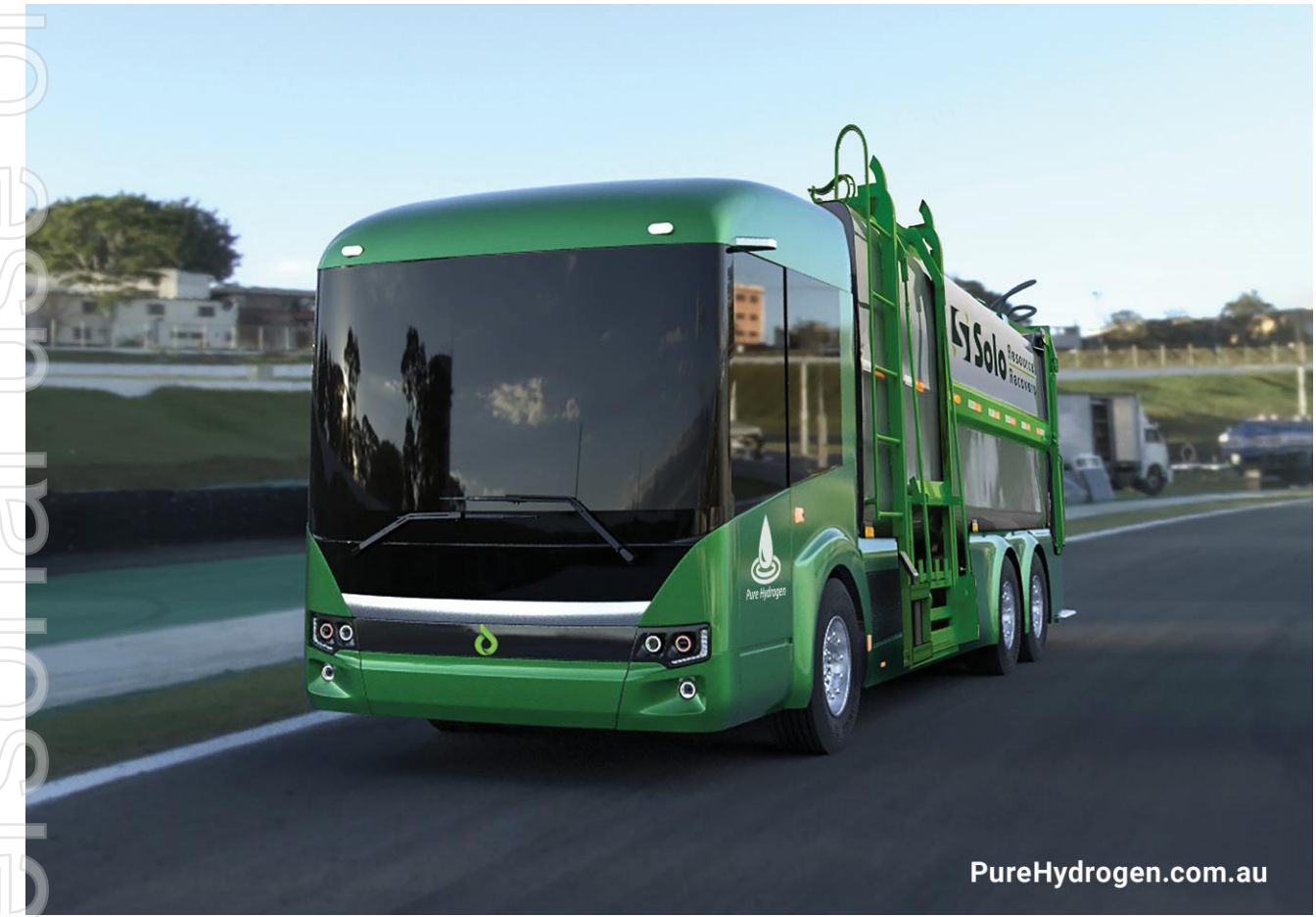
Image 1: A render of the Solo general waste collection truck to be delivered in 2024.