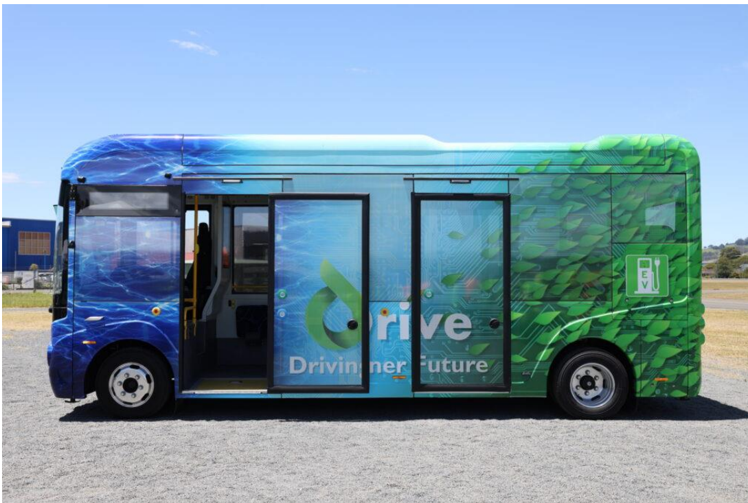
Image of Zero Emission HDrive Electric Powered Bus

Sydney, 12 September 2023: Australian clean energy company Pure Hydrogen Corporation Limited (ASX: PH2 or 'Pure Hydrogen') is pleased to announce that its HDrive International subsidiary ('HDrive'), for which it has a 60% equity interest, has secured an executed sales agreement for the supply of two electric mini-buses valued at over $700,000 ('the order'). The order, from Sapphire Coast Buslines in New South Wales, will see HDrive supply two battery electric ('BEV') 18-seat low floor mini-buses. The contract has been executed on a cash basis, with the buses expected to be delivered during the first quarter of 2024.