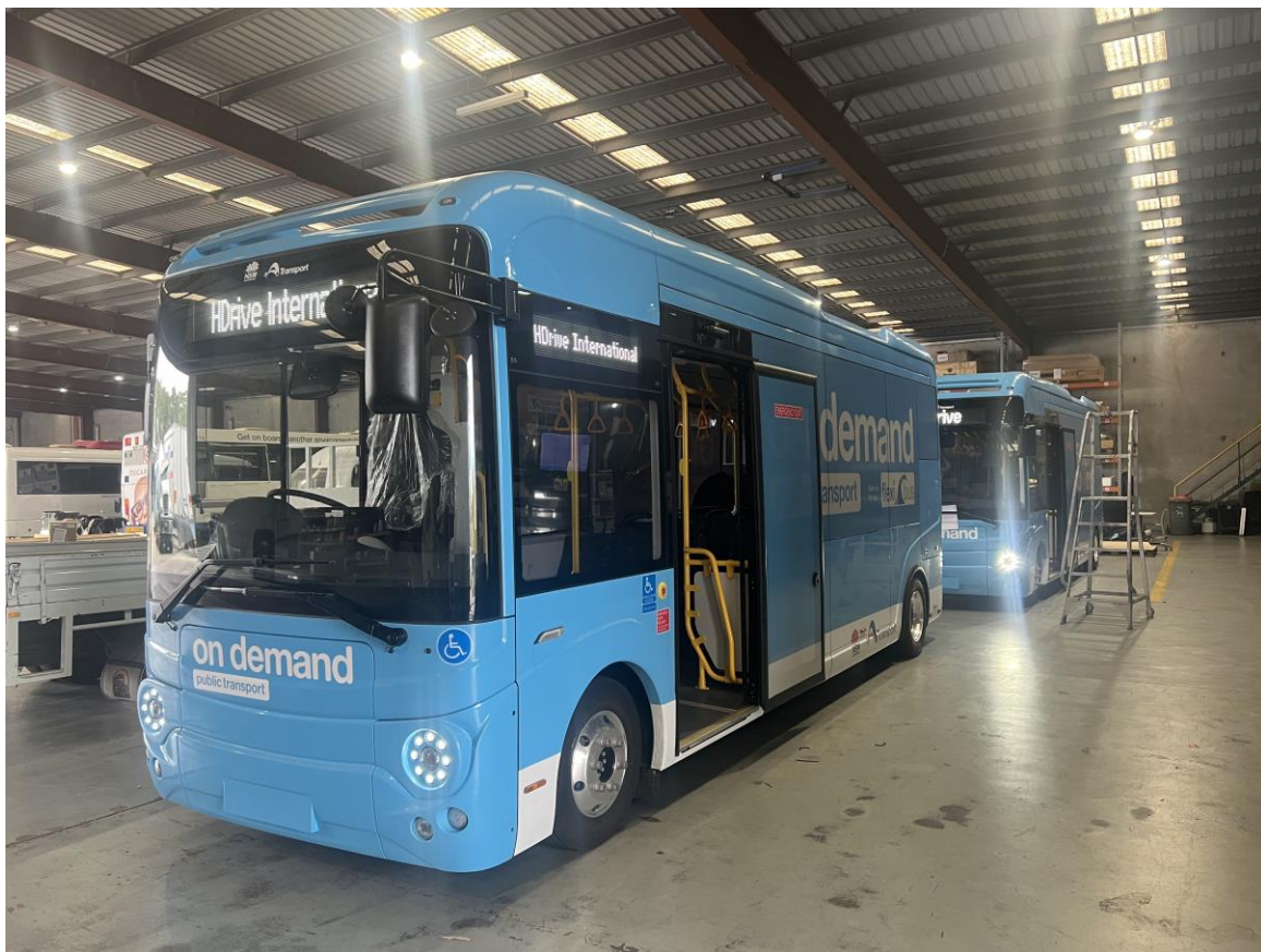
Image: The EV70 Mini Buses being readied for delivery

Sydney, 2 April 2024: Pure Hydrogen Corporation Limited (ASX: PH2) (‘Pure Hydrogen’ or ‘the Company’) is pleased to confirm that its majority-owned subsidiary, HDrive International, has successfully delivered two EV70 mini-buses in accordance with the terms of its supply agreement with Sapphire Coast Buslines in New South Wales (refer ASX Announcement 12 September 2023).