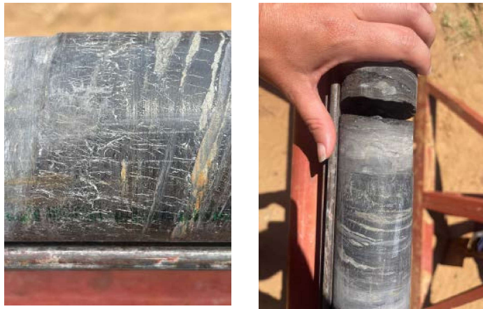
Image 5: of Core samples taken during the quarter at Serowe Gas Project