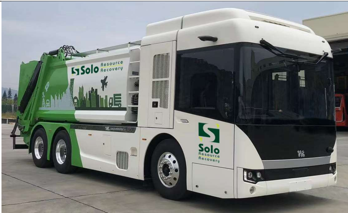
Image 3: Solo general waste collection truck to be delivered in 2024