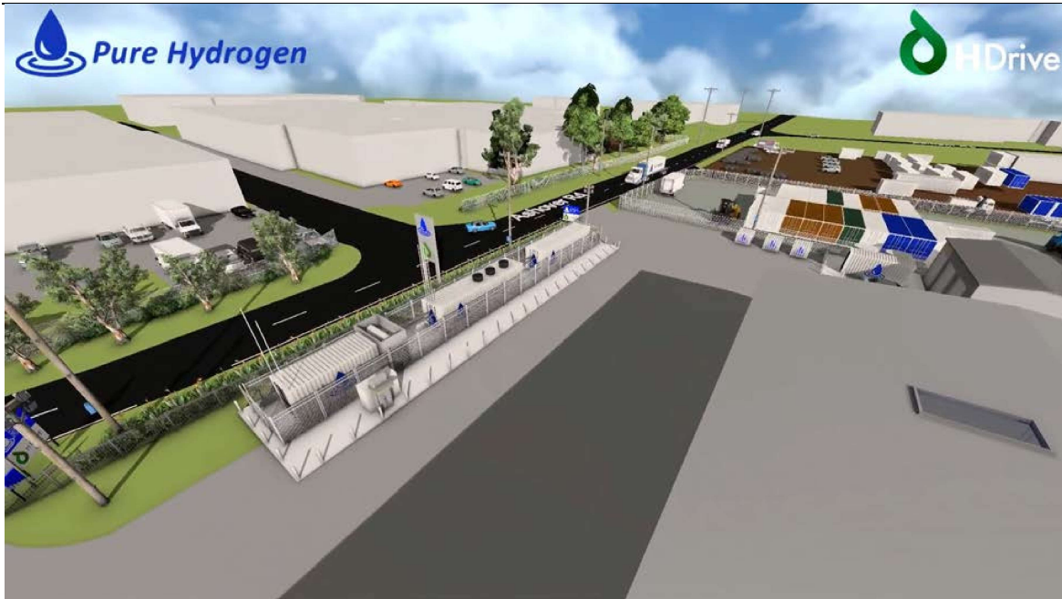
Image 4: Pure Hydrogen's first micro-hub refuelling site at Archerfield Airport – elevated view

The lease marks Pure Hydrogen's first step in developing a network of 'capex-lite' micro-hubs that can produce green hydrogen using green electricity sourced from the grid. Pure Hydrogen will generate green hydrogen at the site with a state-of-the-art electrolyser which on order, and will be combined with compression and storage facilities for manufacturing and sales.