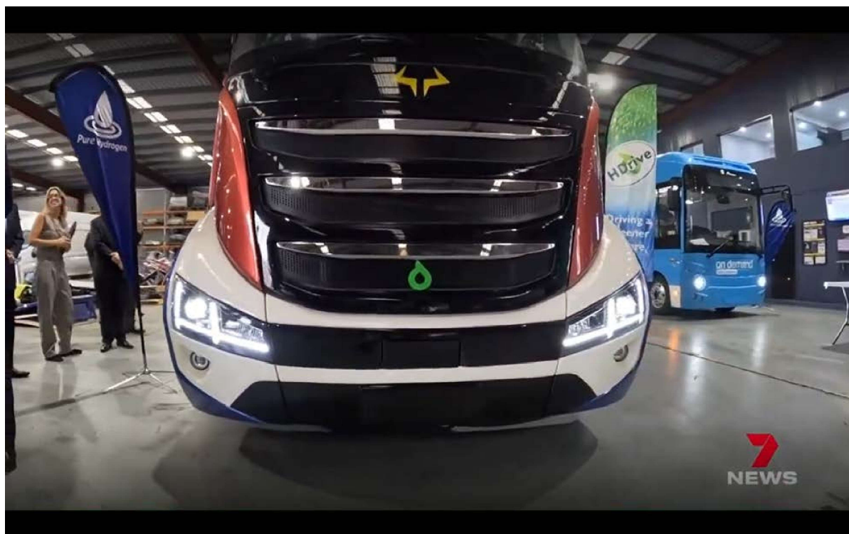
Image 2 – HFC Taurus Prime Mover and EV70 Minibus (in background) at the Drive Day